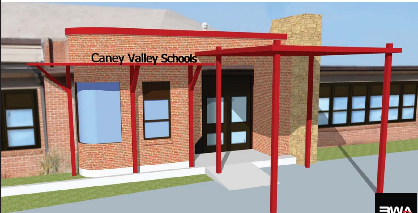
PROPOSED NEW HIGH SCHOOL & MIDDLE SCHOOL ENTRANCE